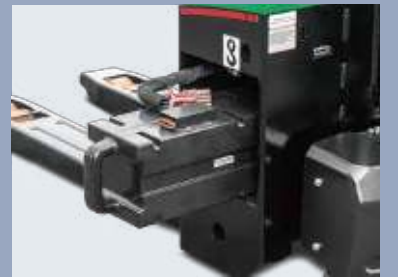
Easy for exchanging battery