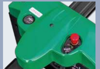
Body feature smooth lines and affluent sense of movement, and compact profile, in accord with the latest appearance design trend