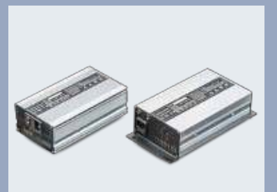
The charger has compact body and is easy for carry