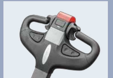
The modular tiller is simple but reliable and beautiful, all parts inside it can be replaced separately and all operations can be done easily with one hand