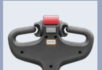
The upright-tiller running function allows it to work within confined space, such as container